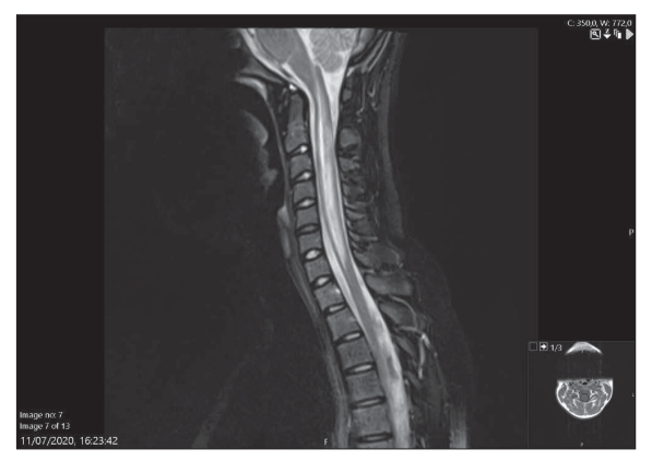
Figure 2. Brain MRI (coronal T2-weighted images) showing a hyperintense medullar lesion that extends from bulbomedular transition to C7 with spinal cord expansion.